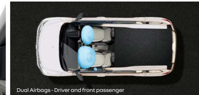
Dual Airbags - Driver and front passenger